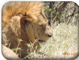
A lion in Tanzania

We referred 78 patients for cataract surgery, and are in the process now of raising funds to pay for the surgery. At $20 an eye, a few dollars goes a long way! After our work we went on a four day safari into several of the game parks of Tanzania and saw breathtaking sights.