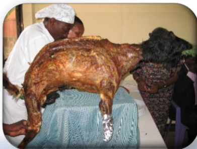
Whole roast goat

We were told that we fit close to 2700 with glasses in the four days we were there. We may have worked hard those four days, but I can't imagine a better way to spend a vacation. Oh yeah, we went on a safari too.