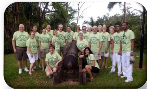
The Jamaican VOSH team 2013

The mission was a huge success and the weather was perfect! Approximately 60 new glaucoma cases were diagnosed as well as several visually significant cataracts. The mission was assisted by the Port Antonio Rotary club. A return trip is planned in two years.