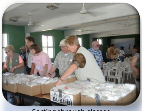
Sorting through glasses In Teacapan, Mexico

Others are more outgoing and will give you a huge hug. It is a very humbling experience to be able to assist people who have not been able to see to read, cook, sew or make simple repairs around their house.