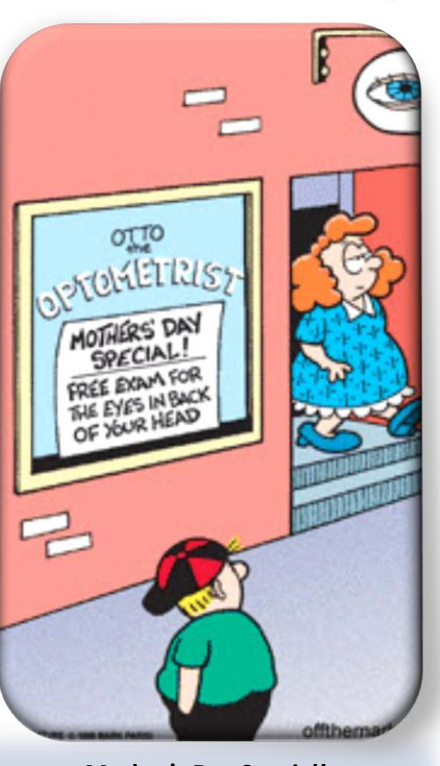
Mother's Day Special! Free exam for the eyes in back of your head